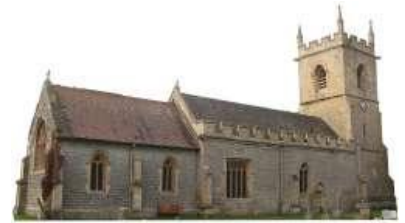
Hinton on the Green